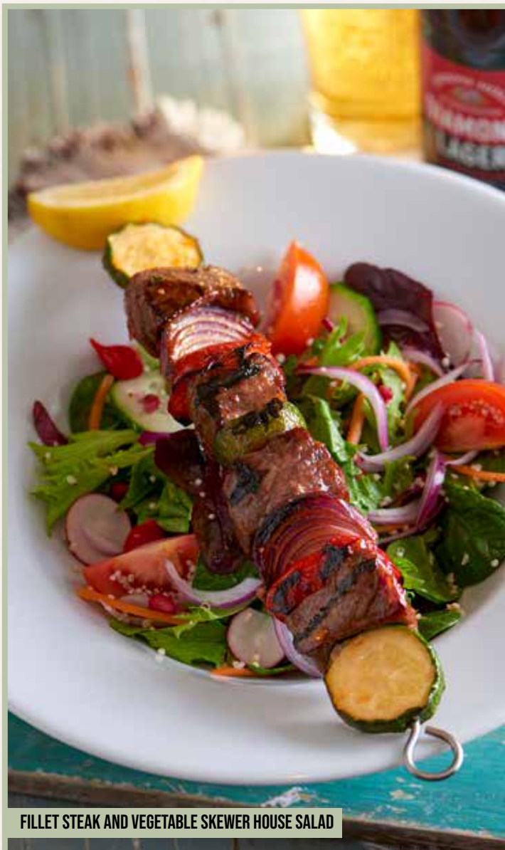
FILLET STEAK AND VEGETABLE SKEWER HOUSE SALAD