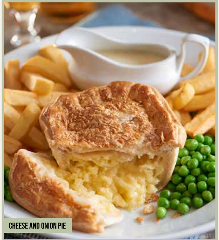
CHEESE AND ONION PIE

Poppadoms, mini vegetable samosas, mini sweet potato curry bites, minted yoghurt dip and lime pickle