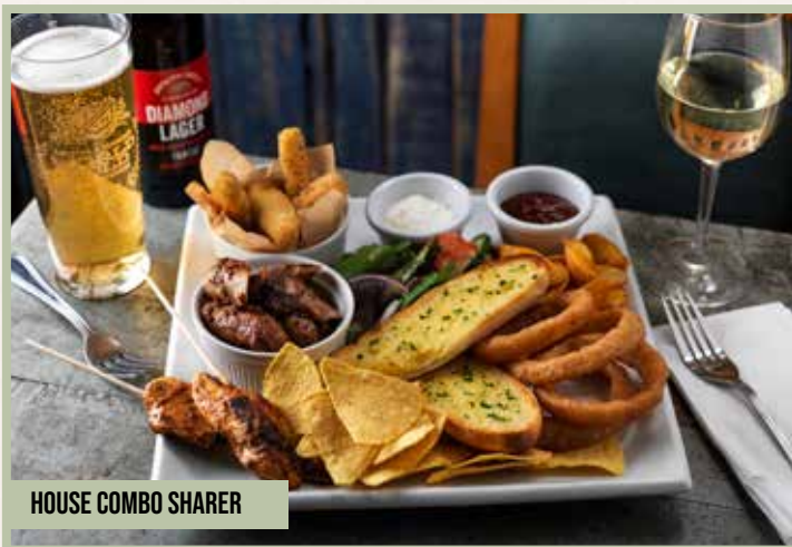
HOUSE COMBO SHARER

Crispy chicken breast skewers, honey and mustard sausage bites, crispy seasoned halloumi fries, potato wedges, garlic bread, beer battered onion rings, tortilla chips and dressed salad with soured cream and BBQ sauce for dipping