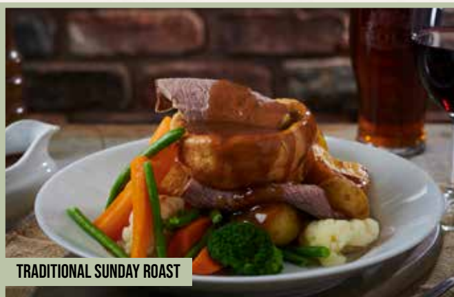
TRADITIONAL SUNDAY ROAST