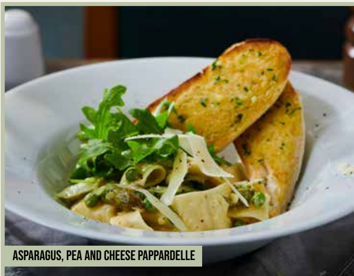
ASPARAGUS, PEA AND CHEESE PAPPARDELLE