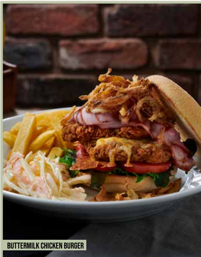
BUTTERMILK CHICKEN BURGER