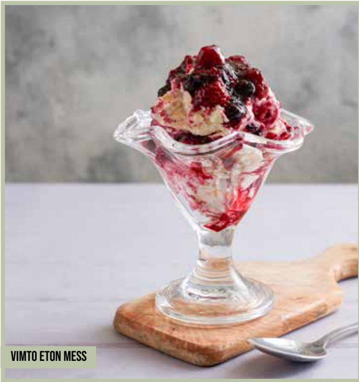
VIMTO ETON MESS